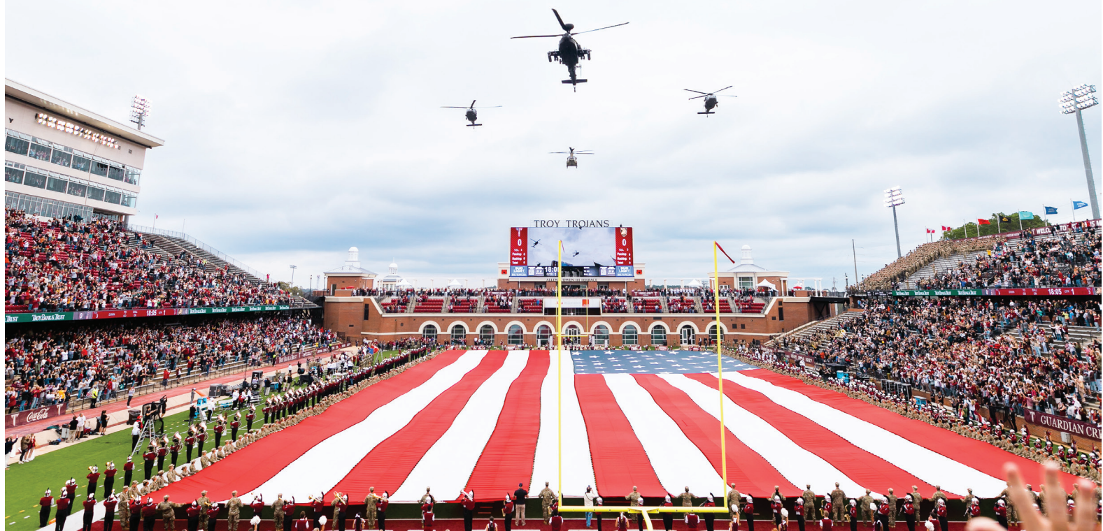
Fort Rucker aircraft fly over Troy University's Veterans Memorial Stadium Nov. 12 just prior to the university's annual military appreciation game versus the Army Black Knights. Troy edged past Army, 10-9.

SERVING THE U.S. ARMY AVIATION CENTER OF EXCELLENCE AND THE FORT RUCKER COMMUNITY SINCE 1956 VOLUME 72 • NUMBER 16 • NOV. 22, 2022