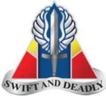
1/13th AVN REGT