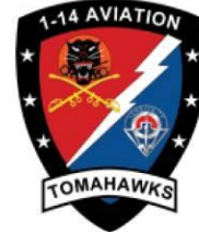
1/14th AVN REGT